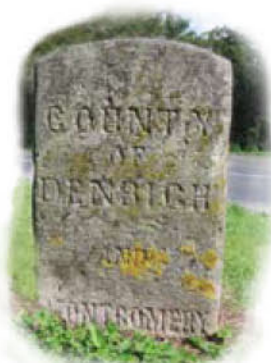
The County Stone marks the border between England and Wales

The lime-burning Hoffmann Kiln built in 1899 took over from less fuel-efficient draw kilns, but even this proved uneconomic and the limeworks closed in 1914.